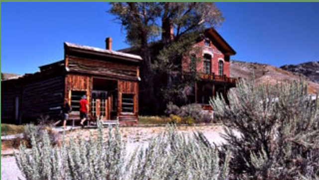
Bannack was Montana’s first territorial capital.

April 17 —Another early morning! Visit Bannack with a history that is as colorful as the gold that lured the many miners, robbers, highway men, and vigilantes. Tour the town and ride to Road Agent Rock for outstanding views of this beautiful, wildlife filled part of Southwest Montana. Head home in the late afternoon.