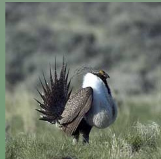
Witness the Male Sage Grouse Dance and Boom at a Lek Site Under the Moonlight!

April 16 —Rise at 3AM to venture out before dawn with Hank Fischer to a sage grouse lek where males put on a spectacular display as a full moon gives way to a colorful sunrise. Return to the lodge for a hearty brunch and mid day nap before an afternoon looking for sage grouse signs from the back of your horse.